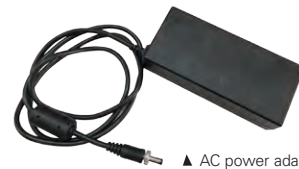
▲ AC power adapter (for MPC102-845-J)